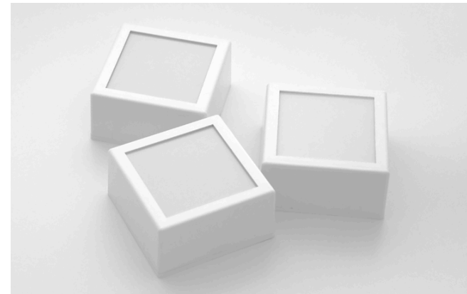
figure 3. Pixel-tiles injection molded cases with diffuser-ITO composite.

The diffuser-ITO composite was created by layering a flashed opal diffuser glass, an optical adhesive, and a Pilkington TEC 15 conductive glass, which is a glass infused with ITO while molten. The edges of the composite were covered with a conductive copper vinyl that was connected to our sensing and data transmission circuits.